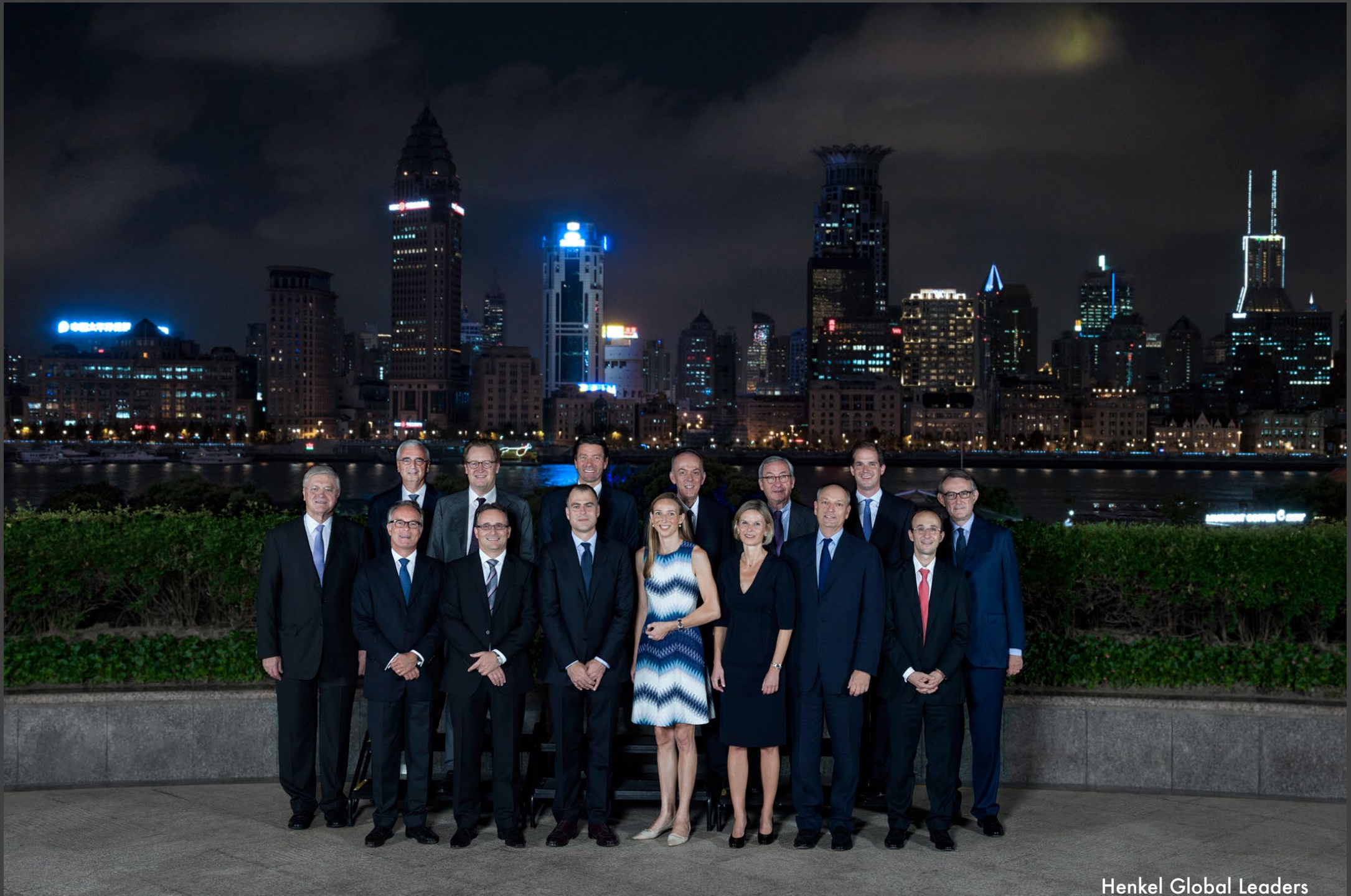
Henkel Global Leaders