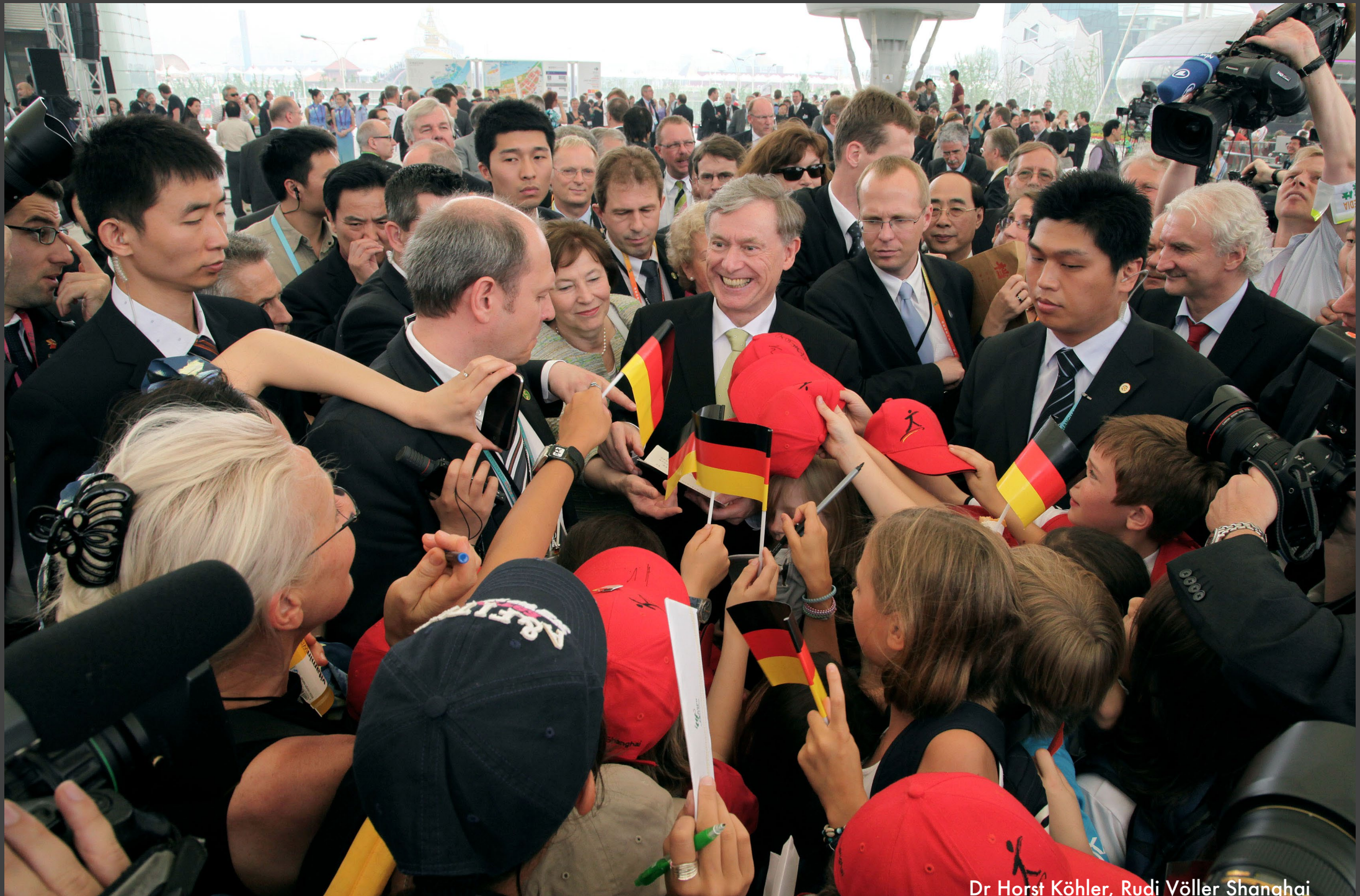
Dr Horst Köhler, Rudi Völler Shanghai