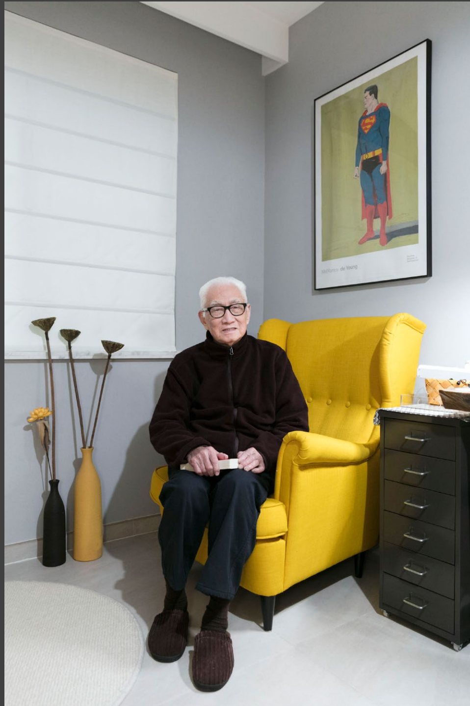
Writer Ping Ru El Pais Magazine